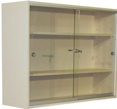
Wall or floor mounted lockable display cabinet