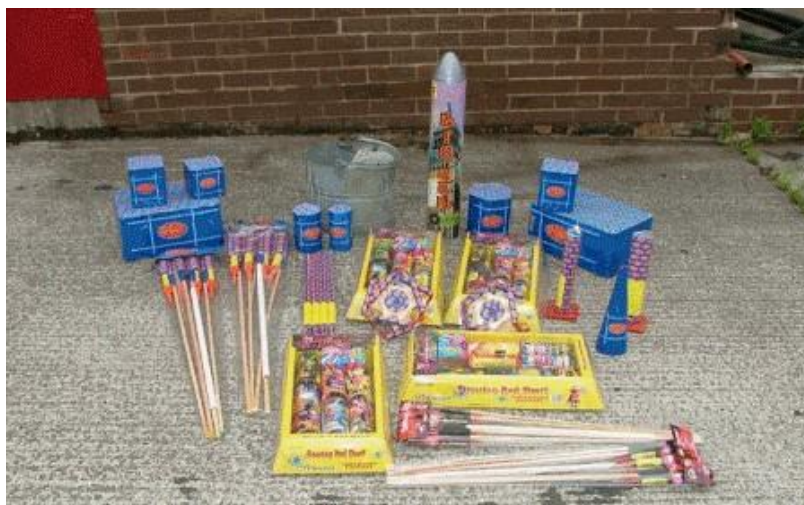
An example of 12.5 Kg NEC of loose fireworks for display in a cabinet

The above quantities are subject to a maximum of 12.5kg NEC per cabinet .